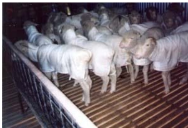
Note the floors on which the sheep will spend the rest of their lives.

Sheep suffer without temperature control in sheds — they cannot flock together to keep warm in the cold and, in the heat, rugging (the wearing of nylon coats) can lead to overheating. You can easily imagine your own suffering if wearing a nylon / plastic raincoat in February!!